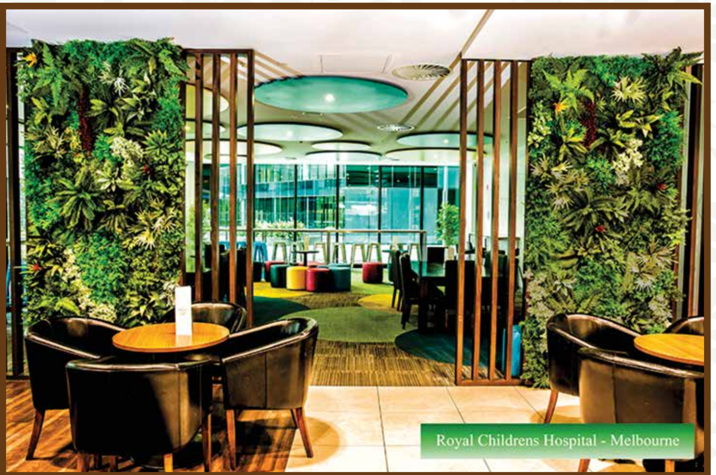
Royal Childrens Hospital - Melbourne