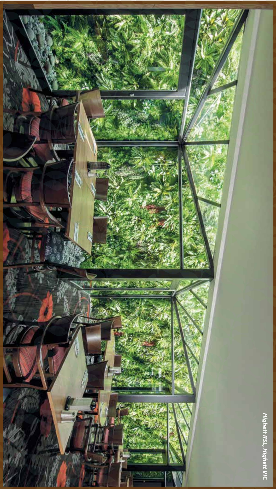
Highett RSL, Highett VIC