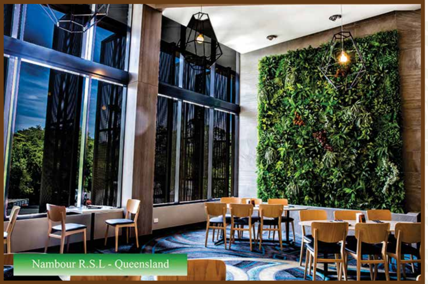
Nambour R.S.L. - Queensland