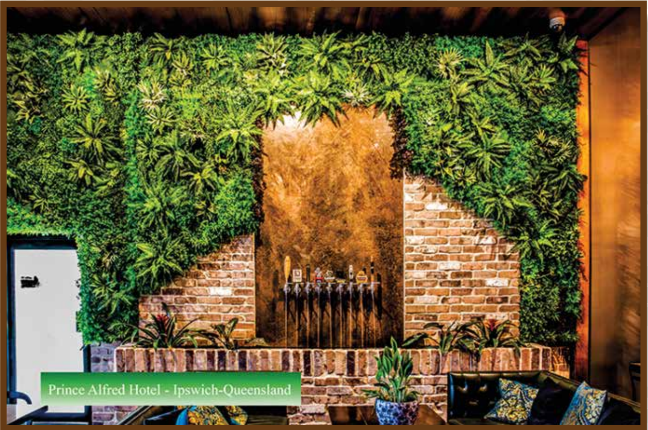
Prince Alfred Hotel - Ipswich-Queensland